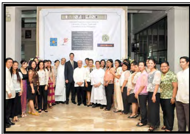
University and UnionBank officials pose for a souvenir photo with the UST Librarians.