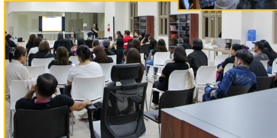
Some photos during the Library planning and team-building.