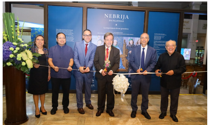
Ribbon cutting signaling the opening of the exhibit.

The exhibition was an adaptation of the original exhibit NEBRIJA (c. 1444-1522). El orgullo de ser gramático ( Grammaticus nomen est professionis ), curated by Teresa