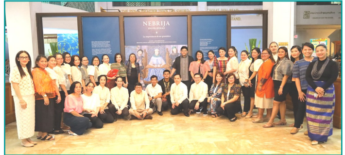
Various photos during the opening of the exhibit.