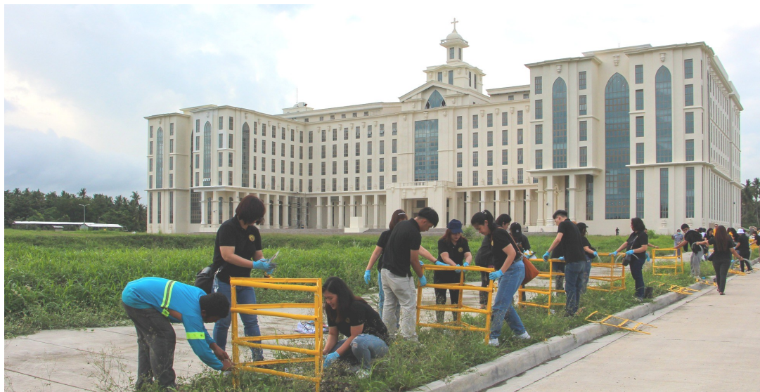
Spreading roots for a greener future.

The Miguel de Benavides Library has taken a significant initiative by convening its annual planning and team-building event at the latest UST campus in Mindanao, specifically at UST General Santos (GenSan). This strategic decision reflects the Library's strong commitment to growth and development, emphasizing the library staff's integral role in this process.