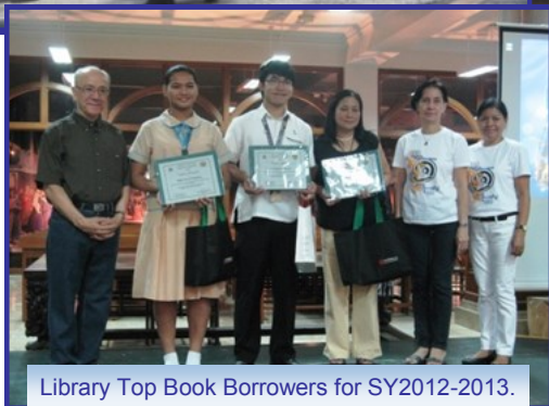
Library Top Book Borrowers for SY2012-2013.