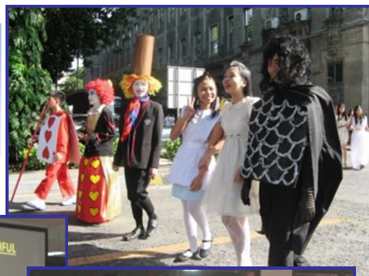
EHS Book Lovers' Club Officers in 'Alice in Wonderland' characters costume.