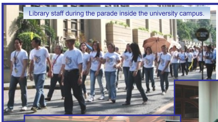
Library staff during the parade inside the university campus.

To add fun and excitement, there were raffles and trivia during the program. PowerBooks generously provided eighteen (18) books and five (5) binders to be raffled to participants while the UST Library gave away especially made gifts for the occasion to twenty two (22) participants who answered correctly trivia questions about the library. PowerBooks also provided a photo booth where participants lined up to have their souvenir photos taken.