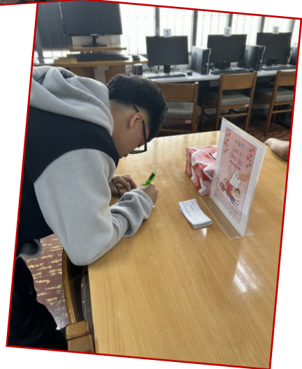
Students participate in the "Love Notes: A Wall of Words," (Top) & "Love at First List" (Bottom)