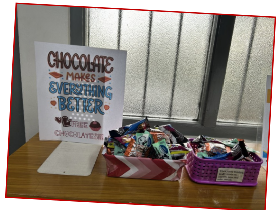
Free chocolates for everyone!