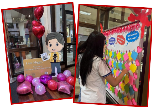
Balloon decorations (L) and the Love-rare Message Wall (R) greet Library users on Valentine's Day.

The celebration of Valentine's Day on February 14 was alive and well among the Thomasian community. Faculties, colleges, departments, offices, and students, all had their own little way of celebrating this wonderful occasion. Of course, the Miguel de Benavides Library is not to be left out with its project titled: “ Library Love Vibes ,” which consisted of simple activities sharing love around the Library.