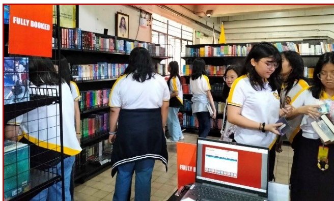
Fully Booked offers exciting books for the students.

These activities brought a ton of energy and excitement to the students, sparking a renewed love for reading. It was a reminder of how books can bring people together, inspire, and open up new worlds!