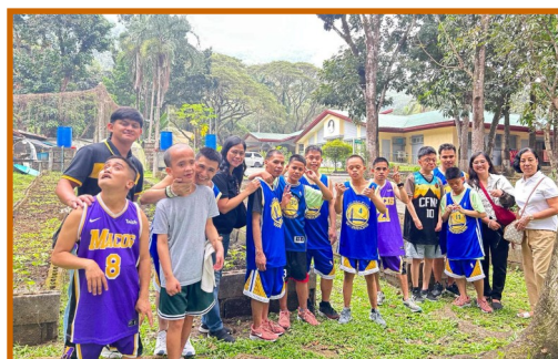
The children of Cottolengo Filipino, sporting their jersey for a morning exercise routine.