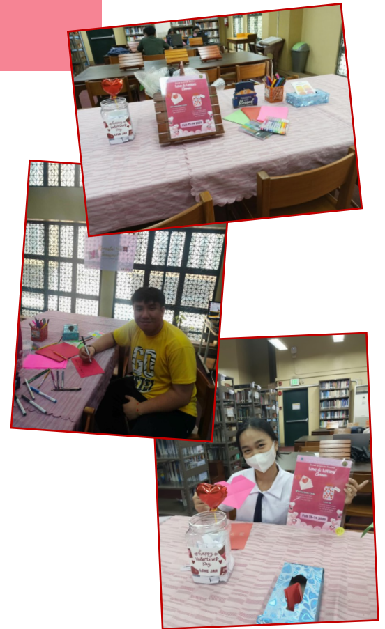
The "Love & Letters Corner" of the Social Sciences Section allowed students to write out their feelings for Valentine's Day.

Valentine's Day is not just about grand gestures; it is also about recognizing and appreciating the people around us. The Love & Letters Corner reminded students of the power of a simple, thoughtful message. Whether it is a beautifully crafted card for a close friend, a note of appreciation for a professor, or a playful message meant to brighten someone's day, each piece carries significant meaning.