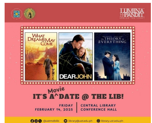
The “It's a Movie Date @ the Lib!” announcement on the Library Facebook page.

Happy Valentine's Day to everyone! – from your Thomasian Librarians and Library Staff.