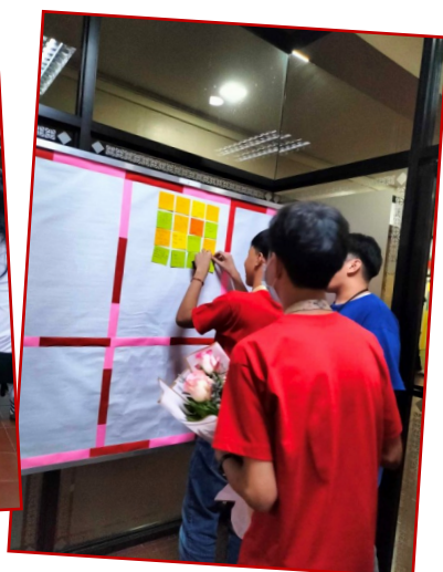
Blind Date with a Book (L) and Share Your Library Love Board (R) activities in the JHS Library Branch.

• Share Your Library Love Board – Students wrote sticky notes, what they love most about the library and posted them on a board outside the Library section. Some shared that it is a great place for studying, a spot to relax with friends, or even a sanctuary to escape stress. Here are a few thoughts: