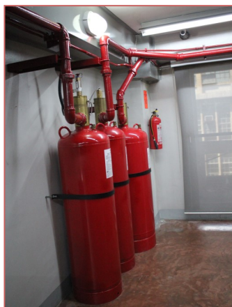
Fire suppression system

To protect the library collections especially rare book materials, the UST Library acquired FM200 also known as HFC227ea fire suppression system from Safeway Fire Safety Specialist. It was installed at the Stack Room of the Antonio Vivencio del Rosario UST Heritage Library and was officially activated last February 01, 2019. A brief presentation and an actual demonstration were conducted in two batches to formally orient the library staff. The first session was held last February 1, 2019 with the following participants: Juanita Subaldo, head of the Physical Facilities and Crisis Committee, In-house Mechanical Engineer Antonio Espejo of the UST Facilities Management Office (FMO), Jenneth Capule, Heritage librarian, and Ginalyn Santiago, head book restorer. The second batch was held last February 8, 2019 and the participants were the library administrators Ms. Ma. Cecilia D. Lobo, chief librarian, Ms. Diana V. Padilla, assistant chief librarian, and library support staff namely Nemesio Magtaan, Raissa Meig Young, and Rafael Travilla.