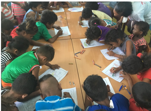
The children while doing their coloring activity.