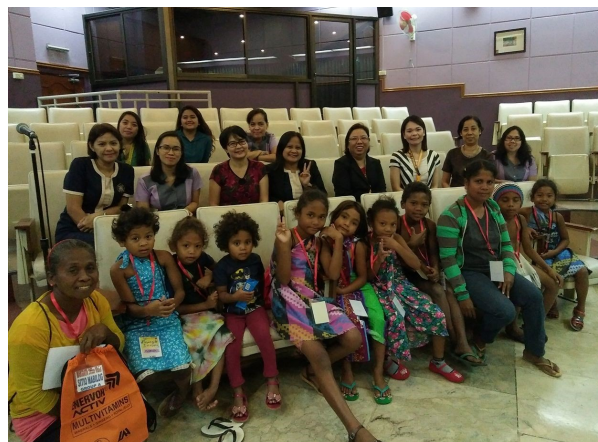
Librarians and support staff pose with the Makibata kids and their guardians.

Before they left the library, the children handed over a paper with their group photo and their thank you message to the department for the warm accommodation and support.