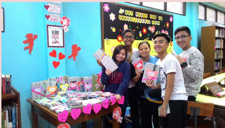
The students choose their books for their blind dates.

In celebration of the love month, the UST Education High School (EHS) Library conducted a "Blind Date with a Book." This is just one of the many interesting library games and fun activities for high school students. Books were mystically wrapped in old newspapers, charmingly designed with brilliant paper ribbons and tagged with popular quotes and clues in the dorsal part of the book to make its title guessing easy and more exciting. Students were allowed to take home their selected wrapped books which served as their Valentine's date.