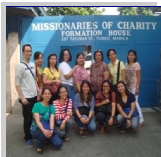
Some USTLA officers and members pose for a souvenir photo in front of the Missionaries of Charity Home for the Elderly.

F ostering love and care for the elderly as represented by “lolos” and “lolas” needs to be preserved and inculcated in the youth and in the succeeding generations of Filipinos. Former President Fidel Ramos declared March 11-18 of every year as “grandparents week.” To honor grandparents is one way of raising the people’s level of awareness on the important role that senior citizens play in society. A Spanish proverb “The oldster who cannot predict is not worth a sardine” reflects the common perception that an older person’s worldly experience is a valuable community resource.