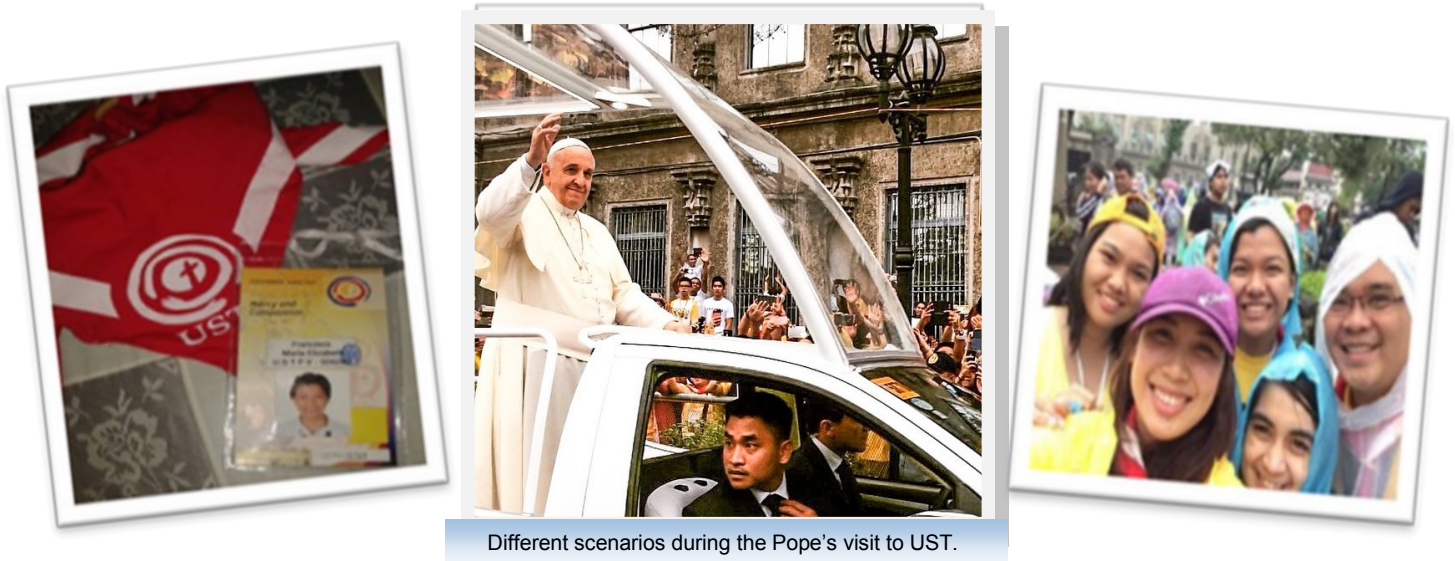
Different scenarios during the Pope's visit to UST.

"THINK WELL. FEEL WELL. DO WELL." The Pope reminded the youth in his speech to