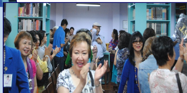
Happiness is marked on the faces of the jubilarians.