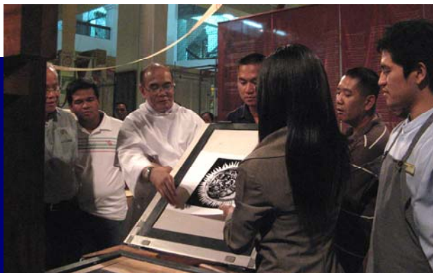
Photo shows the exhibit guides as they assist Fr. Rector in using the replica of the printing press.