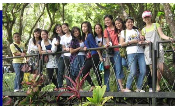
Graduating working scholars from batch 2011 as they pose for a souvenir photo with some library staff.

The “treat to graduating working scholars” is the UST Miguel de Benavides Library's way of showing gratitude to students who have served the Library during their college days. It is “bonding time” for the graduating working scholars with their respective head librarians, library administrators, and some library staff.