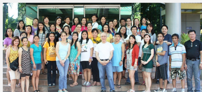
Library staff poses for a souvenir photo at MMLDC building facade.

Upon arrival to the place, the group proceeded to the Academic Hall for the planning session. For a