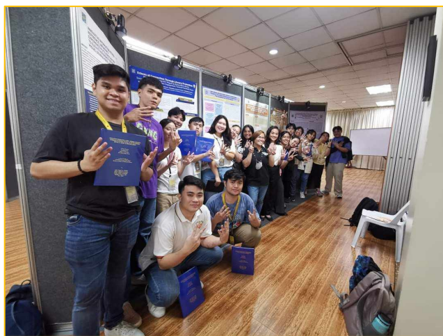
BLIS students pose for the poster exhibit of Lourdes J. Custodio Research Festival, which featured their theses .

In addition, the BLIS students had a poster exhibit last May 10, 2024, during the College of Education's 9th Lourdes J. Custodio Research festival held from May 7-14, 2024, which summarized their thesis topics, methodologies, findings, and conclusions, making complex research accessible to a broader audience.