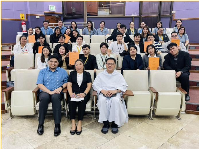
BLIS students, with Library administrators and their Librarian advisers, all smiles after their defense.

Traditionally, librarians have supported academic research, providing essential resources and guidance on information literacy. However, with this new initiative, practical expertise was integrated into the research activity, ensuring that students are well-prepared for the rigors of research.