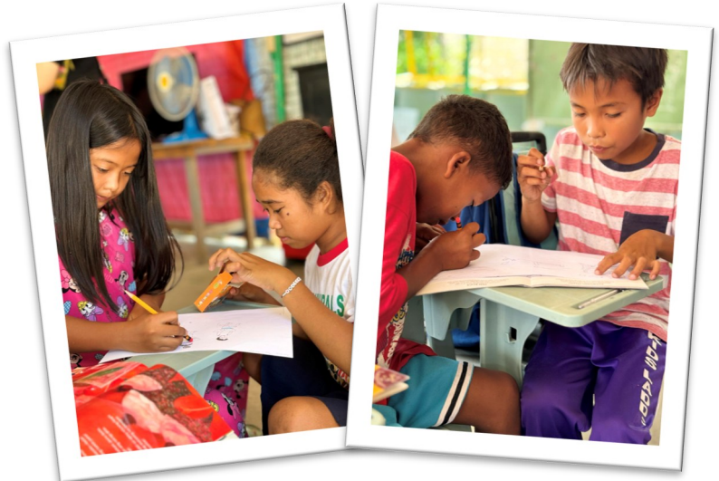
The children reflect the on the book they've read through drawing, as part of the activity.

At the heart of the activity was the 'DEAR' format, which stands for "Drop Everything and Read." Twenty one (21) enthusiastic students were encouraged to select books of their choice from the Library and immerse themselves in the captivating world of storytelling. After their reading sessions, the students expressed their thoughts and reflections