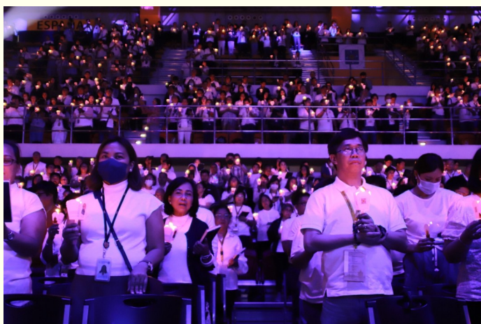
Thomasian community during the candle lighting ceremony