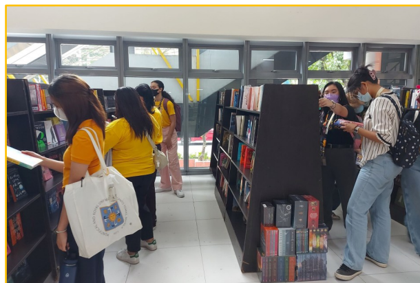
This year's book fair was organized by SHS Library in coordination with UST SHS Alinaga.