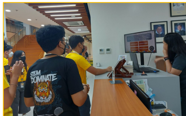
SHS students enjoying the Library Spin Wheel Interactive Game.

A series of light discussions to elevate the conversations in STEM youth.