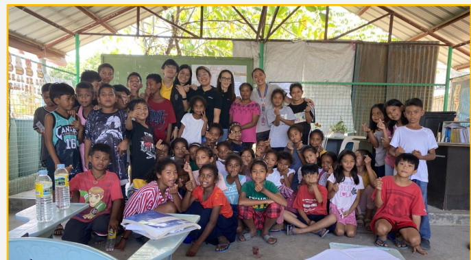
University representatives with the Aeta children of Sitio San Martin, Bamban, Tarlac.