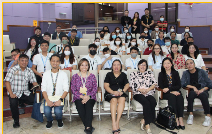
Participants pose for a group photo during the UST NHM Forum

Information Services, National Committee on Archives, National Heritage Committee, and the Philippine Librarians Association, Inc.