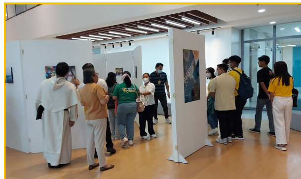
One of the exhibits during the SHS Week Festivities ( Baliktanaw Photo Exhibition by MAD Strand and MIL Learning Area).

STEM Talks: The Heights of Physics , held at the Consultation Rooms 1 & 2 (Science, Technology, Engineering, and Mathematics Strand)