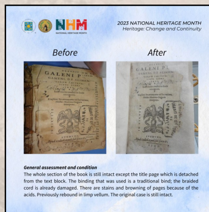
Conservation Highlight featuring the "De alimentorum" of Galenus Pergamenus

Galenus, Pergamenus. (1549). De alimentorum facultatibus libri tres - de Attenuante victus ratione . Lyons: Apud Gulielmum Rovillium.