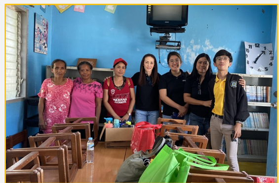
Library staff members and university Simbahayan representatives with the community members of Sitio San Martin.

"Somewhere along the way, we must learn that there is nothing greater than to do something for others." - Martin Luther King Jr.