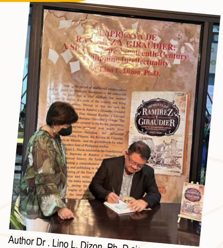
Prominent historians, personalities, and officials representing cultural agencies, along with the library administrators grace the book launch of Imprenta de Ramírez y Giraudier.