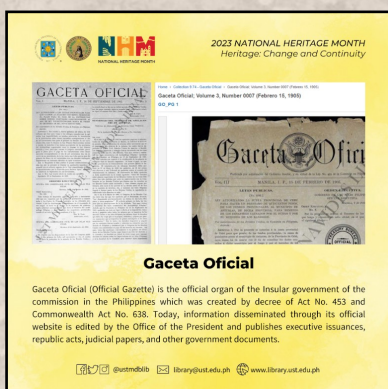
Digitization highlights sample photos featuring Gaceta Oficial