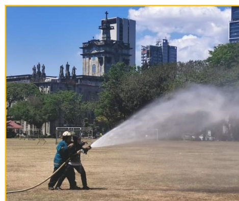
Demonstration on the use the firetruck’s fire hose