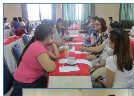
Some photos during the planning and team building activities.