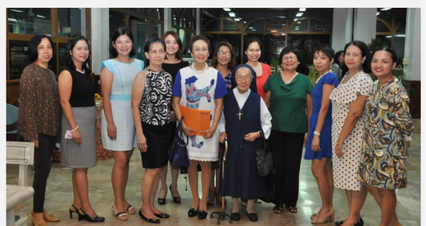
UnionBank guests with some of the UST Librarians.