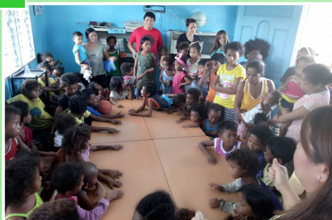
UST librarians and Aeta kids during the activity.

The UST Miguel de Benavides Library staff once again visited Sitio San Martin, the community of Aetas in Bamban, Tarlac last November 19, 2017.