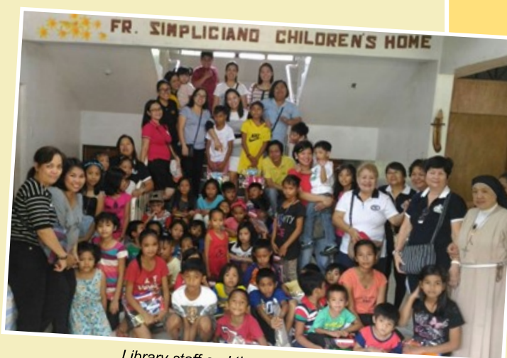
Library staff and the children smile for a souvenir photo.

The activity concluded with the distribution of school supplies to the children.