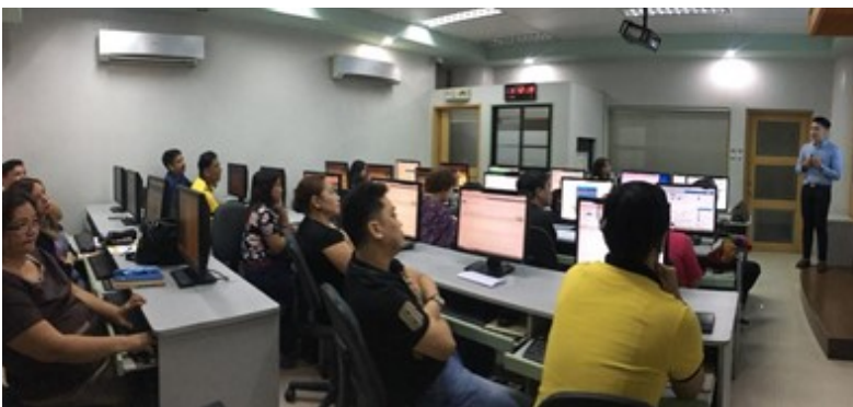
Turnitin training