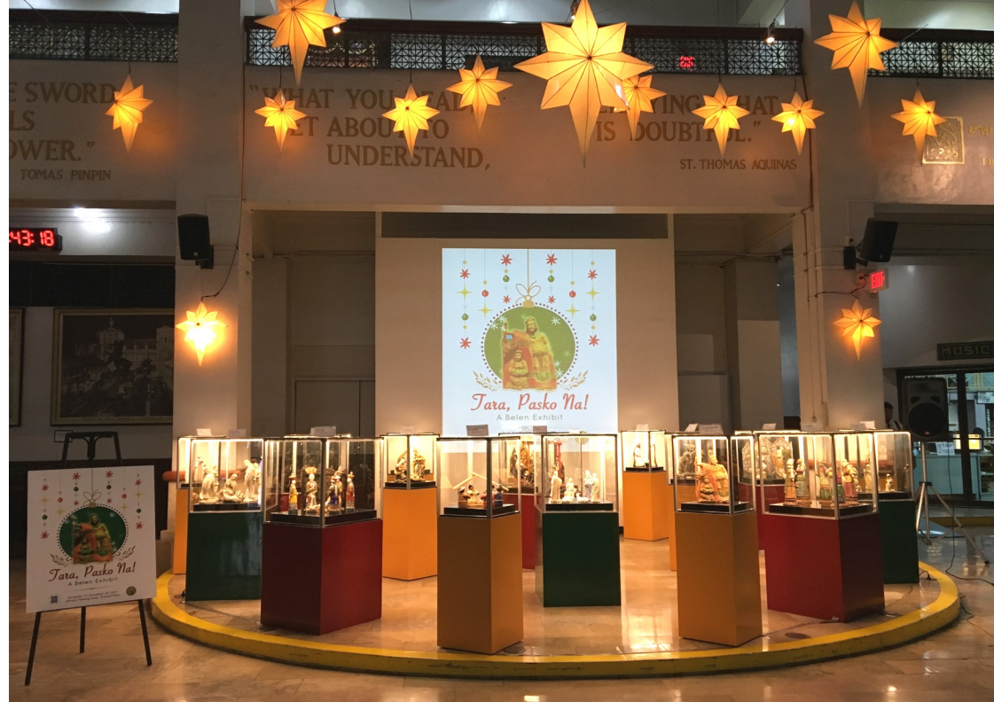
Nativity sets from different countries are displayed at the library lobby viewing area.

“the real reason in celebrating Christmas is to remember the birth of our Lord Jesus.”