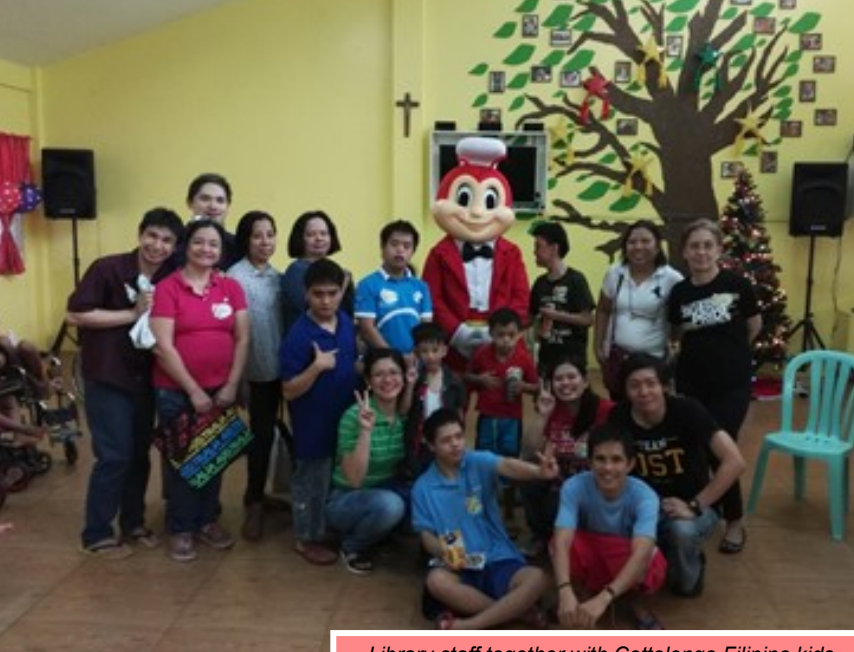
Library staff together with Cottolengo Filipino kids