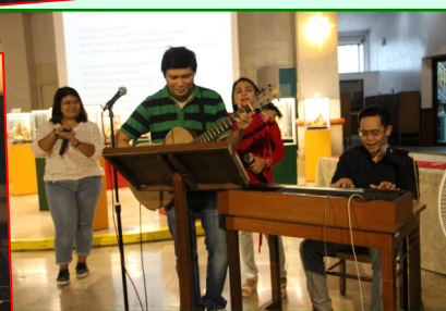
Some photos during the party.