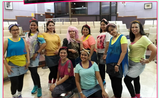
The Groovy Librarians in their 80's costumes.

The UST Librarians have once again proven the Thomasian community of their dancing prowess as they amazed the crowd with their 80's dance number during the annual Christmas Party of the University of Santo Tomas Faculty Union (USTFU) held at the Plaza Mayor on December 07, 2017.