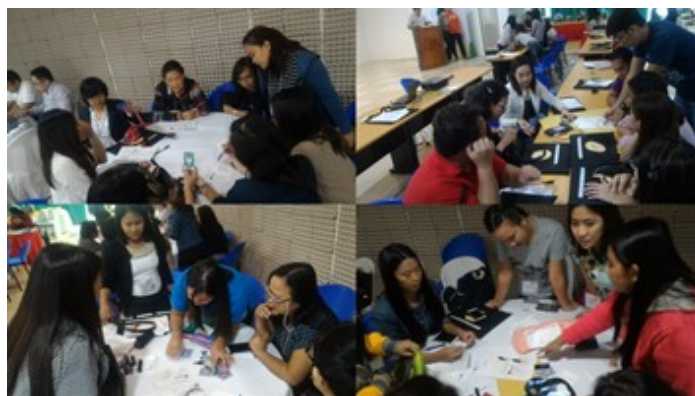
The participants while engaging in the workshop.