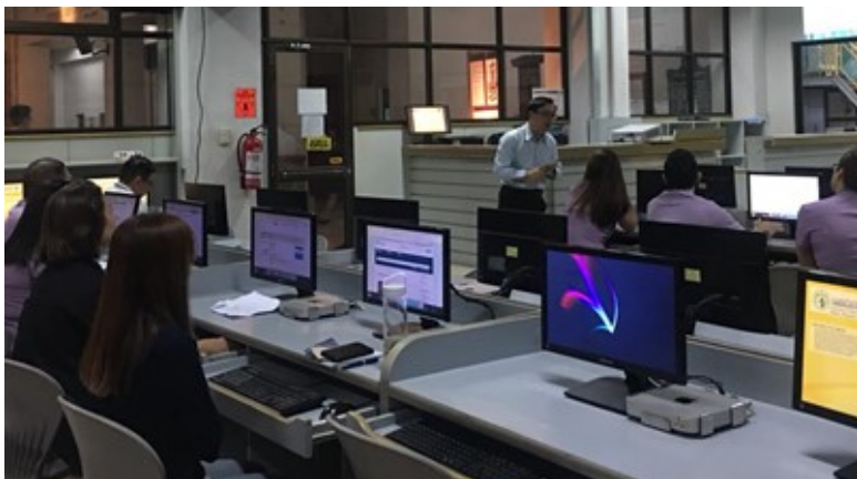
IEEE Xplore Digital Library demo and training

Turnitin is available at the Graduate School (3F) and the Science and Technology (2F) sections of the UST Library. The USTGS generously gave two accounts to help the Library in providing a service where faculty members can check students' output against plagiarism.