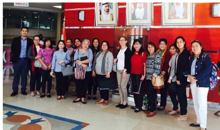
Conference and benchmarking participants pose for a souvenir photo.

The Dubai Public Library provides services for the community. The community will have to apply for a one year library membership with corresponding fee and refundable anytime he