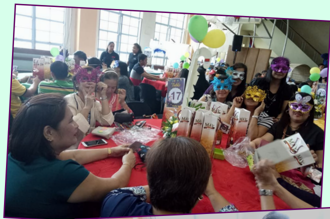
Some photos during the party.