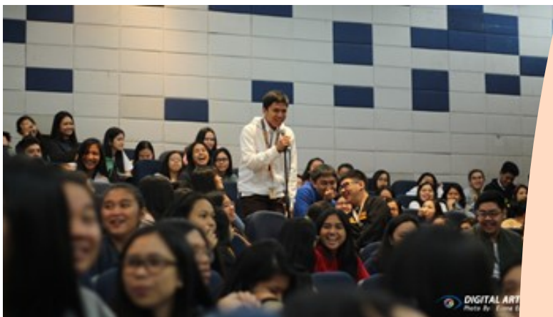
Open forum for the Junior High School students