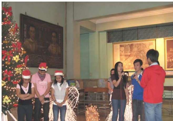
A group of working scholars showing their hidden talents during the program.