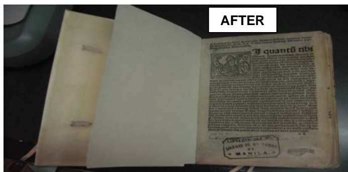
Practica in Arte Chirurgica

The book is loosened due to torn binding. The spine cover is missing. The text block is intact but the pages have stained and foxing already occurs on the pages. Title page is missing and the final index is incomplete. The dimension of the book is: 6"x 4 1/2" x 1 1/2". The acidity level is Ph 6.