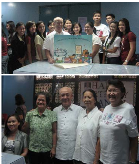
Above: Library San Lorenzo scholars surround the birthday celebrant.