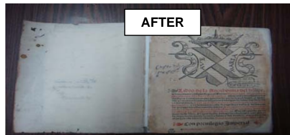
Libro de la Anathomia del Hombre

Rebound in limp vellum. The dimension of the book is 244mm x 180mm x 28mm. The first and last sections of the book are loose and many pages are badly torn. There are worm holes and many stains. The binding used is traditional; braided cord is applied to protect the back of the book. The acidity level is Ph 5.5.