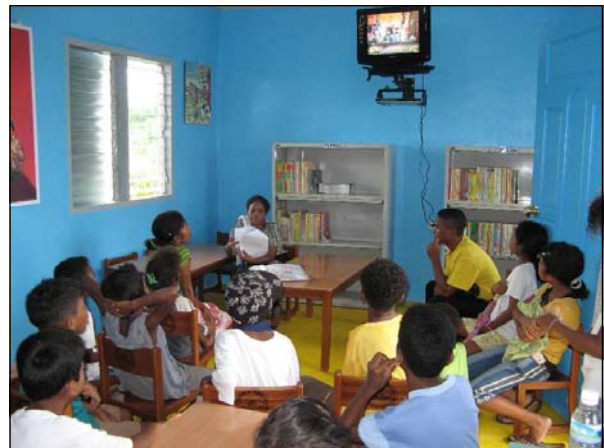
The Aetas enjoy the newly installed audio-visual set.