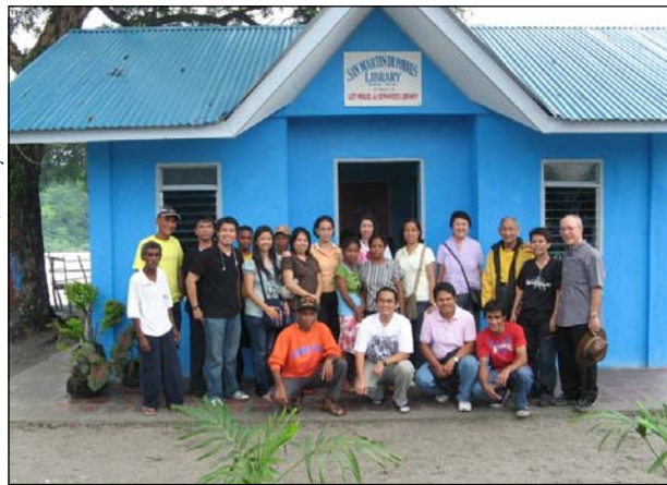
The Library group and the team from Sitio San Martin gathered for a souvenir photo during the blessing with the San Martin de Porres Library in the background.

The project seemed a wishful dream and one of our friends told us that we were losing our time; that we would not achieve anything worth-while with this people. Certainly, we cannot expect children with a precarious level of literacy to become literate by the mere fact of building a library for them. But if missionaries had not built churches in which their faithful could celebrate their faith perhaps they would not have been successful implanting religion on the land.