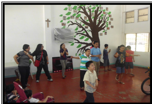
The Librarians together with the kids at Cottolengo Filipino dancing the "Chacha."

The immersion was a success. It gave a great sense of fulfillment to everyone. The Library's exhibit last December 2012 entitled "Misteryo : Ikaw at ang Pasko" requested from the viewers donations to raise funds for Cottolengo and it is just befitting to thank everyone who supported this advocacy.