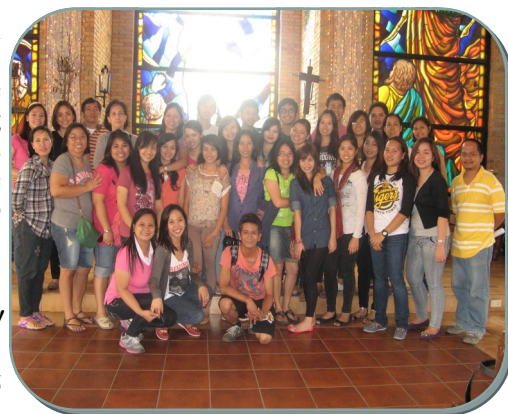
Working scholars with the Library administrators, librarians and library staff at the Transfiguration Chapel in Caleruega.