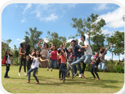
The Working scholars enjoying their jump shot

As early as 6:00 in the morning, the graduating WS were already gathered inside the UST bus, some were still catching up with unfinished businesses, some were sleeping, while others were having chitchats with co-scholars with whom they have not had the chance to exchange words before. As the group left the campus, a prayer was recited for a safe trip.