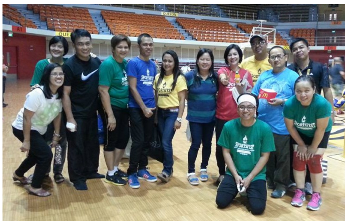
Sportsfest participants pose for a souvenir photo.

Each team was asked to perform a “gimmick” in front of the three judges. After which, there was a parade which served as an avenue for camaraderie. The program proper was held at the UST Seminary Gym which started at exactly 8:30 in the morning. There were also segments that were included, namely, Mr. BaeWatch , cheer dance competition and parlor games, respectively.