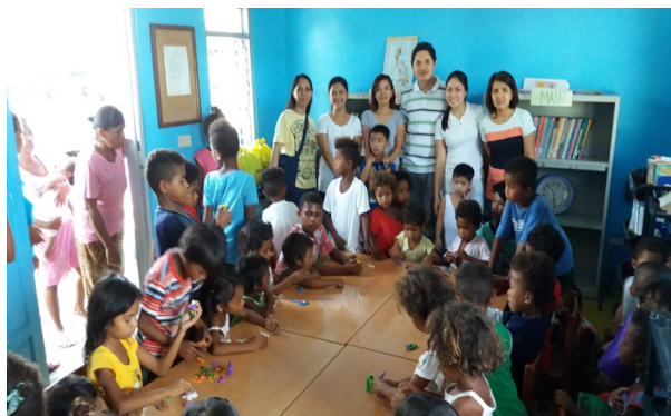
The kids as they do art works with the library staff.