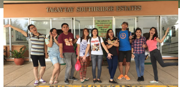
Souvenir photos during the treat.