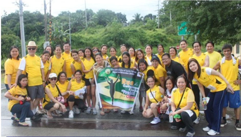
The library staff poses for a souvenir photo.

W illiam Arthur Ward, a known American writer of inspirational maxim, said that the three keys to more abundant living are: caring about others, daring for others, sharing with others. Hence, the UST Miguel de Benavides Library decided to raise funds by organizing a project called “Run for Cottolengo Filipino,” an orphanage non-stock; non-profit religious and non-government organization licensed and accredited by the DSWD and is owned and managed by the Sons of Divine Providence Congregation.