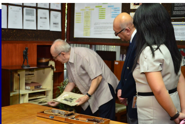
The memorabilia of Mahatma Gandhi.