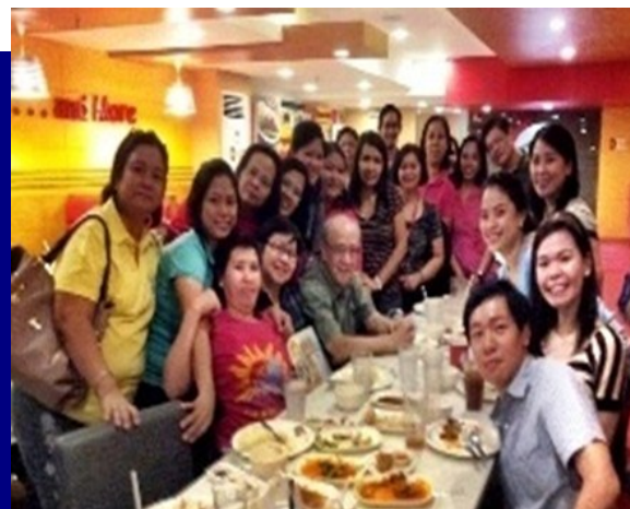
A souvenir photo taken during the despedida.