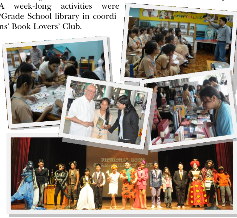
Clockwise: Lecture-workshop; Awarding of top book borrowers; Forum on reading; EHS book fair; Fictional book character contest.