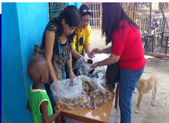
Librarians distribute food to Aeta children.

While outside the library, the other librarians conducted parlor games. Food and gifts were distributed afterwards.