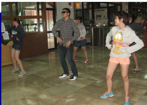
Library working scholars as they display their dancing prowess.

One of the highlights of the party were the raffle draws where cash prizes ranging from Php200.00 to Php1,000.00 were given away to lucky winners. Major prizes were awarded during the latter part of the draws. Parlor games also attracted so much fun and laughter from the crowd.