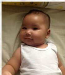
Baby de Leon

To the new moms and dad, congratulations to your new bundle of joys!