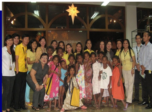
Library staff poses with the kids for a souvenir photo.

University Student Organizations’ Coordinating Council (SOCC) in coordination with the Office for Student Affairs & the UST-Simbahayan Community Development Office (formerly OCD), visited the UST Miguel de Benavides Library. The Makibata carolers (group of Aeta children accompanied by two adults) joyously serenaded the library staff with Tagalog Christmas songs and rendered dance numbers. Cash gifts were distributed to them afterwards.