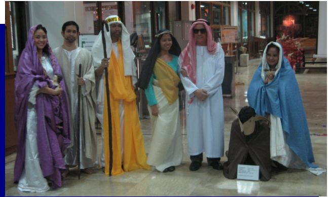
Best in "Christmas Costume" participants.

For their extremely energetic performance, the working scholars from the Science and Technology Section brought home Php2,000.00 as grand prize. The 2 nd , 3 rd , and 4 th places won Php1,500.00, Php1,000.00, and Php500.00, respectively.