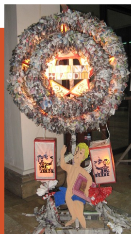
“Parol ng Liwanag”