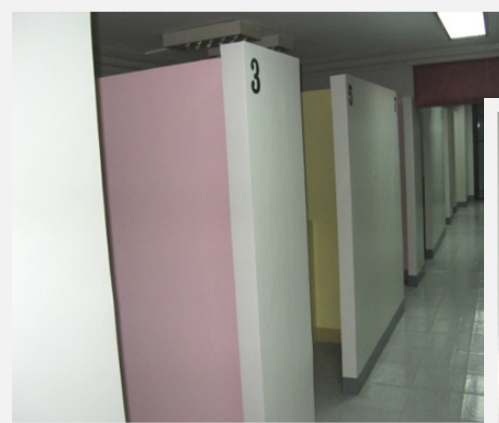
Individual study rooms

“L ibrary facilities should be attractive and designed to provide safety, and promote operational efficiency and effectiveness of use.” This is one of the principles in planning the library’s physical facilities of which the Miguel de Benavides Library also considers. Just recently, the fourteen (14) Individual Study Rooms and the four (4) Discussion Rooms, both at the right wing of the library, had undergone minor renovations. The walls and ceiling are painted with bright colors which add sensory excitement to the library.