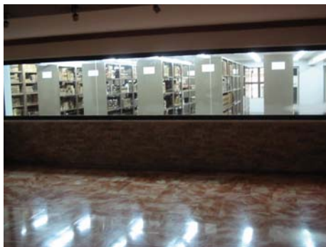
The Stack Room of the future Heritage Library.

This coming January the Library will open a new section that will house all the historical collections of the University of Santo Tomas Library. It will be located at the fifth floor in the area formerly occupied by the Chiang Ching Kuo Center for Intercultural Studies. We are very glad that the University authorities understand the plight of the library to properly house these valuable collections and we hope to meet this