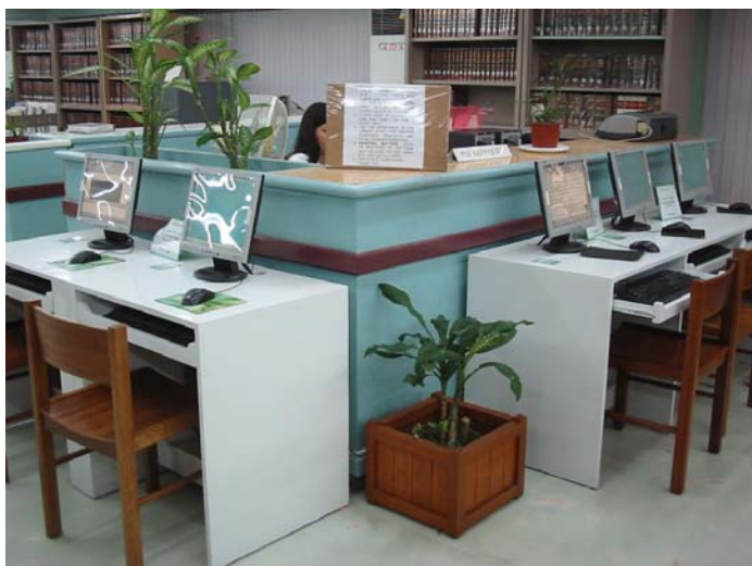
The computer units donated by Equicom which are now housed at the Civil Law section.

The UST Library is indeed very grateful to these "friends of the Library" for their unwavering trust and support to the university. Through their donations, the library is better able to meet the needs for new acquisitions for collections, seeks improvement in the delivery of information and other services. Their support helps to ensure that the Library remains an essential resource to those who rely on it for their teaching and research. ■