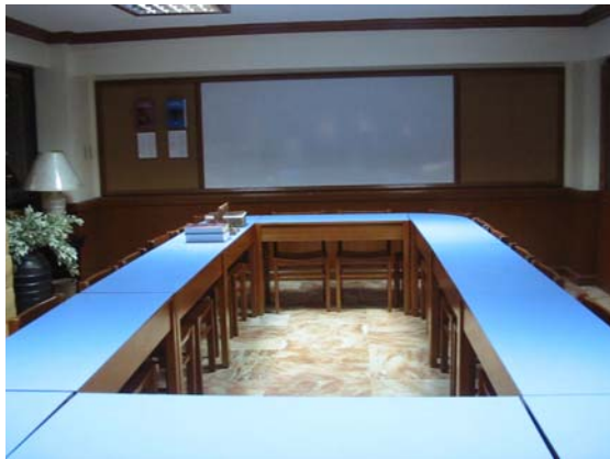
The newly-constructed Lecture Room of the Heritage Library.

But if the UST Library is exerting an effort to keep them it is not for that reason. We think that these books are one of the best witnesses to the growth of the Philippines into a nation, their heritage. This is how we understand heritage: not just as the collection of crummy or precious old books and artifacts, but as a link between past, present, and future, representing livelihood or living. Heritage is derived and handed on from the past; it is the source of our present being; it is the inherited promise bodying to the future. A loss of part of the heritage is