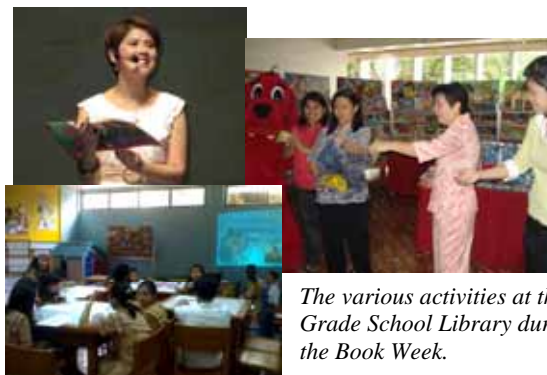
The various activities at the Grade School Library during the Book Week.

The Grade School Library had an early celebration of the National Book Week. There were series of activities which started on November 10, 2008.