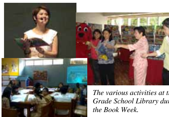
The various activities at the Grade School Library during the Book Week.

The Grade School Library had an early celebration of the National Book Week. There were series of activities which started on November 10, 2008.