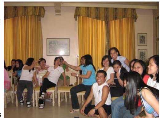
Photo shows the UST Library group in one of the activities during the team building.