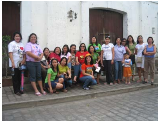
Members of USTLA while having a grand tour in Vigan.

The members of USTLA decided to have their cultural tour in Vigan because of its unique ambiance having retained its ancient urban plan. It took almost nine hours for the group to reach the 408 km. stretch from Manila to Vigan. Nevertheless, the long drive was worth it all. Vigan is a 'living heritage', being the only surviving Spanish colonial city in the entire