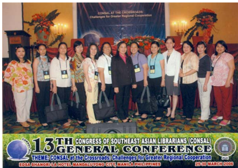
A souvenir photo of the UST Librarians during the CONSAL gathering at the Shangri-la Hotel, Ortigas Center, Mandaluyong City.

The 13th Congress of Southeast Asian Librarians (CONSAL) with the theme Consal at the Crossroads: Challenges for Greater Regional Cooperation was convened in the Philippines. This was held on March 27-30, 2006 at the EDSA Shangri-la Hotel in Ortigas Center, Mandaluyong City. This year's CONSAL was hosted by the Philippine Librarians Association, Inc. (PLAI), The National Library of the Philippines (TNL), CONSAL XIII Executive Board/organizing Committee and the National Commission for Culture and the Arts (NCCA).