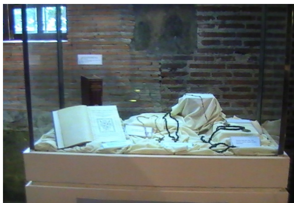
Filipiniana rare books of the Miguel de Benavides Library which are included in the exhibit.

B efore the coming of the Spaniards in the Philippines, Manila was the site of the native settlement called Maynilad (original name of Manila). Maynilad was the center of trade of Asian goods. It was conquered by the Spaniards in 1571. Miguel Lopez de Legazpi built the city within the walls and called it Intramuros. Since then, Intramuros became the political, cultural, educational, and commercial center of Spanish colonial rule in Asia.