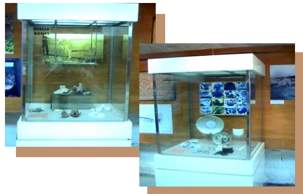
Artifacts found in the Maestranza compound.

Intramuros is truly a priceless place— rich in history and culture, a pride to be shared to the entire world!