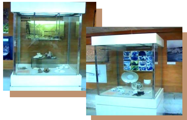
Artifacts found in the Maestranza compound.

Intramuros is truly a priceless place— rich in history and culture, a pride to be shared to the entire world!